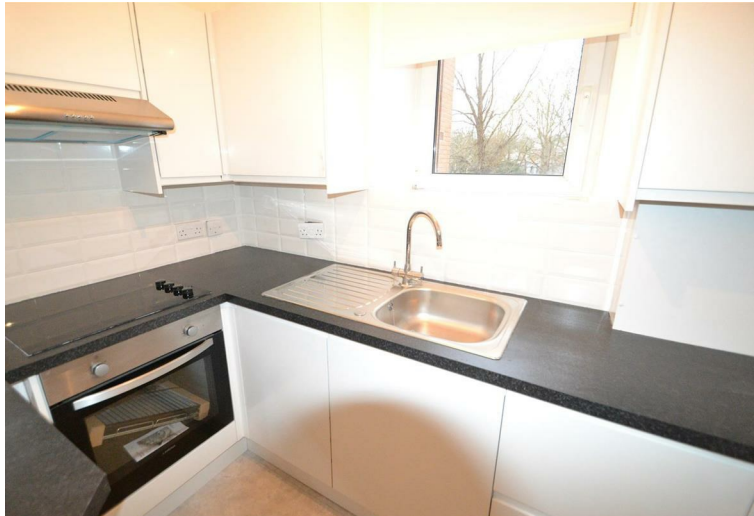
Crescent Road, Crouch End, London £285 Per Week Not specified