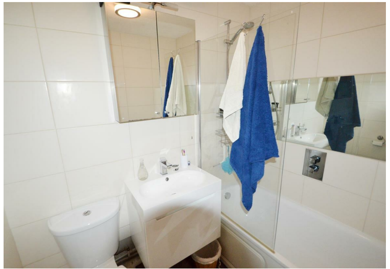
Surrey Quays - Wonderful 1 bed £250 Per Week Part furnished