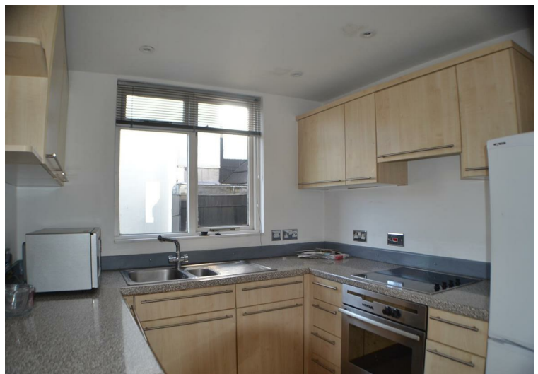
Porter Street, London £435 Per Week Furnished