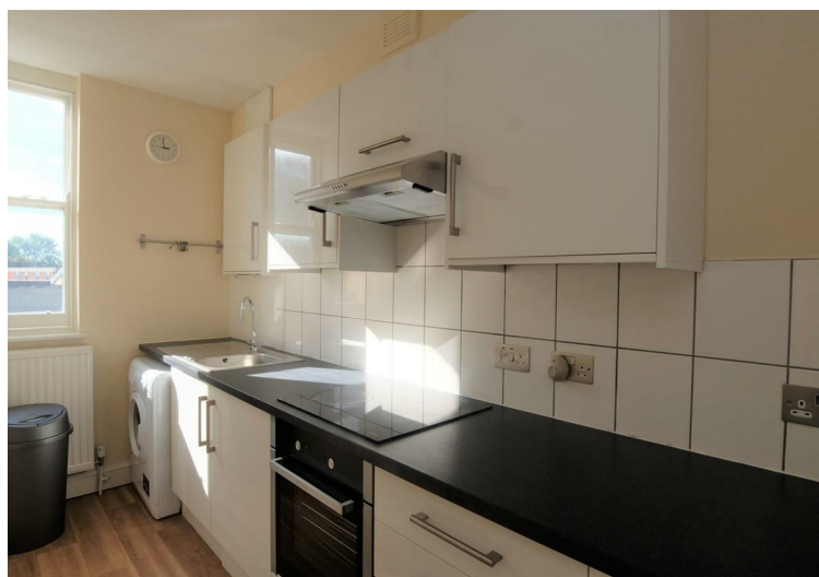
Boundary Road, St John's Wood, NW8 £1,250 Per Month Furnished