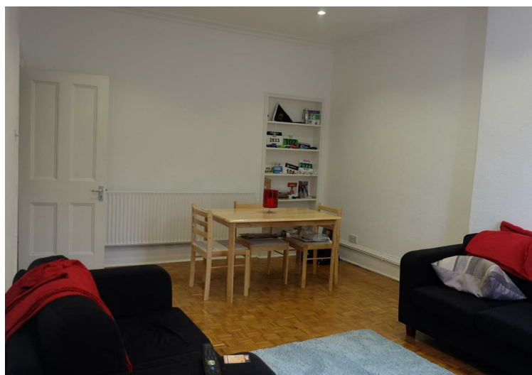
Boundary Road, Camden, London £450 Per Week Part furnished