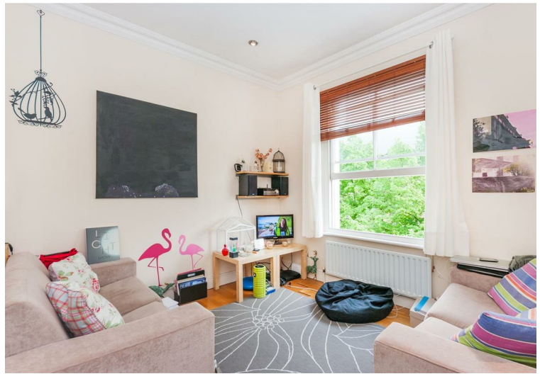
Belgrave Gardens, St John's Wood, NW8 £430 Per Week Furnished/unfurnished