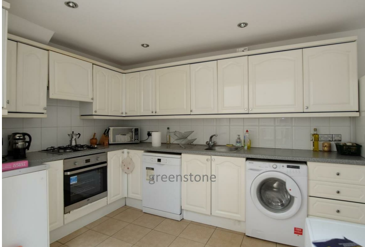
Belgrave Gardens, St Johns Wood, NW8 £2,750 Per Month Furnished