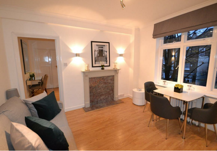
Abercorn Place, St Johns Wood, London £330 Per Week Furnished