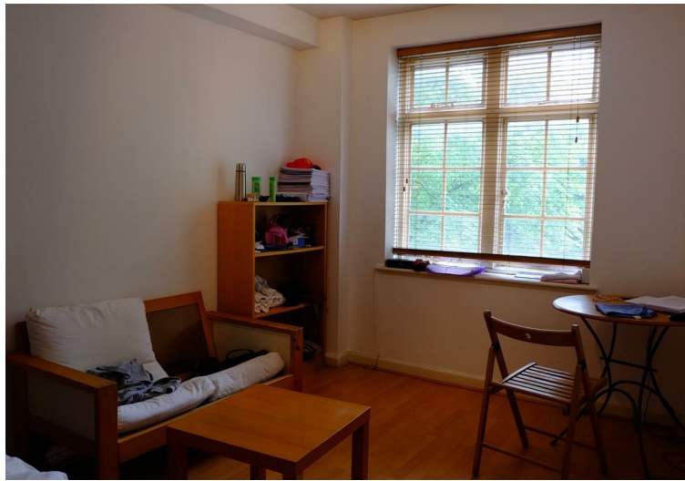
Abbey Road, St Johns Wood, London £275 Per Week Not specified