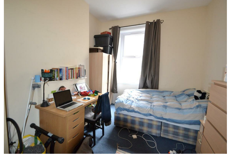
£390.00 pw - 3 Bed Flat with reception room £390 Per Week Furnished